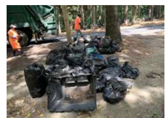
Forest Clean up at Daruty

These measures had a positive impact by reducing the carbon footprint of our school and also contributed to a change in mindset about the impacts of littering on both marine and terrestrial life. Thus, our school community will use the same momentum to build up the future projects for the next part of our academic year. At Northfields, we strongly believe in developing our students into active leaders of a more sustainable world.